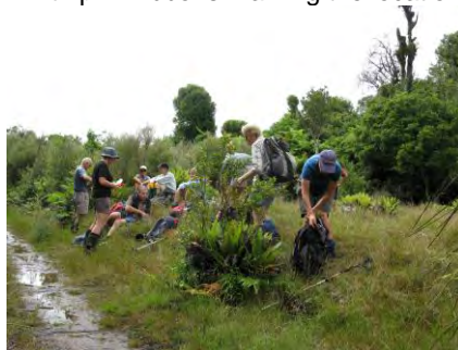
Morning tea at edge of tramway