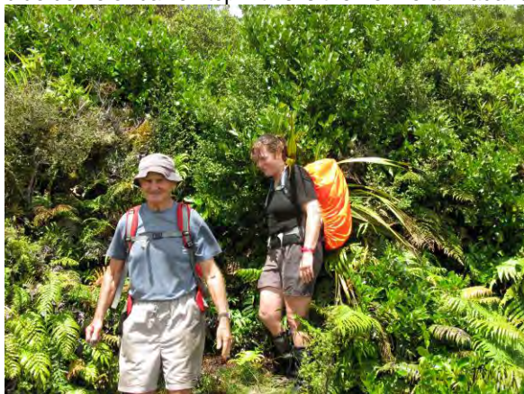
Yes, there is a track behind them