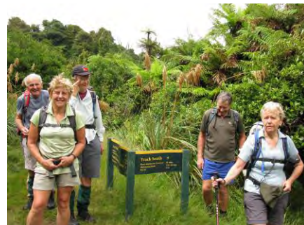
North South track notice