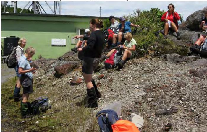
Lunch at the top