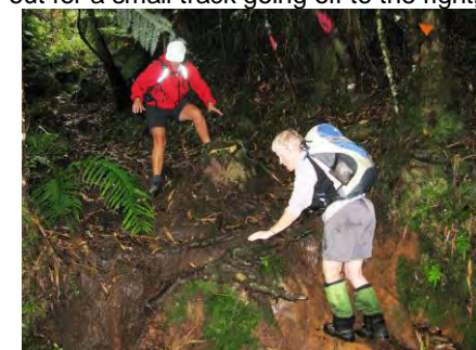
Tricky slope on red clay