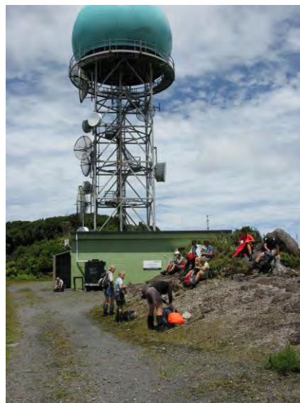
Dome from the service road