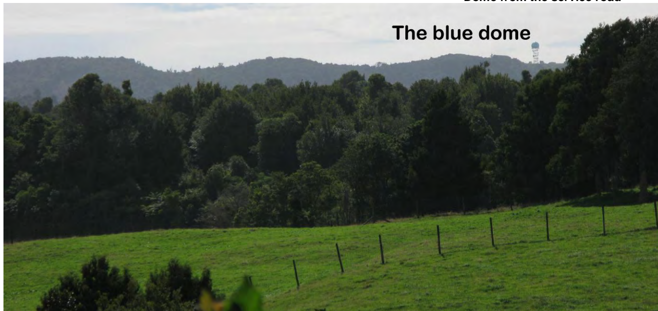
The blue dome