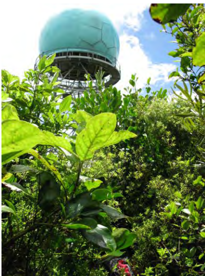
Dome from the bush

Good views of Matamata and Mangatautari and miles of well-developed farm land are available from here but ignore the road that is obviously there to bring in fuel and services for the station – the way out is the reverse of the walk in! Once back out it is nice to sit down and get the boots plus mud off.