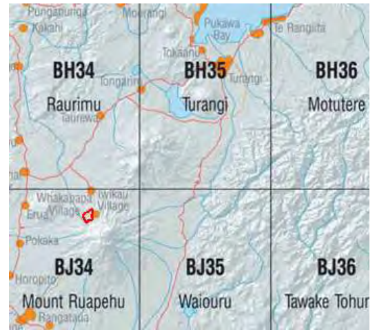
The tramp shows as the red loop on BJ34