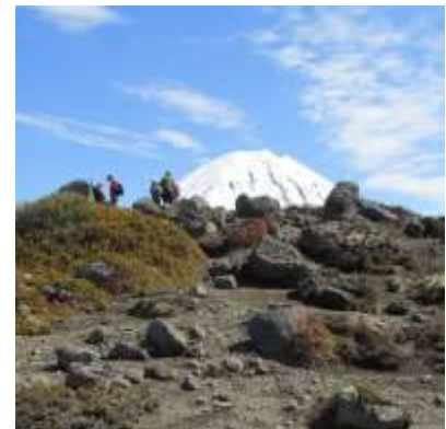
Trampers at WP05

The easy option for returning is to follow the inwards route in reverse targeting the lone tree ( WP09 1213masl ) to the SSE and sidle up the slope to get back to WP07 rather than going all the way down the Waihohonu Stream as shown on the map to WP0T .