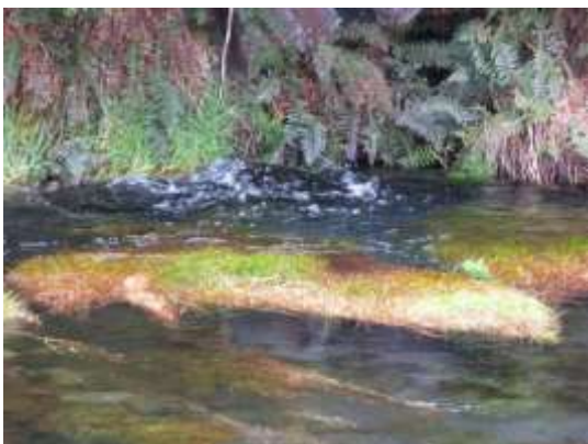
The bubbling spring

Slightly more adventure can be had by heading up and over the small hill above the springs to get on to the true left bank of the Waihohonu stream-line and heading downstream. Most of the walking is easy as it is mainly gravel fan but there is a lot of bog and several stream lines to cross. At some point, see map, cross to the true right bank and continue - but the going does get a bit rough in places till eventually there is little option but to head, steeply uphill to the right.