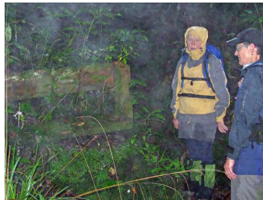
Colourful wet trampers