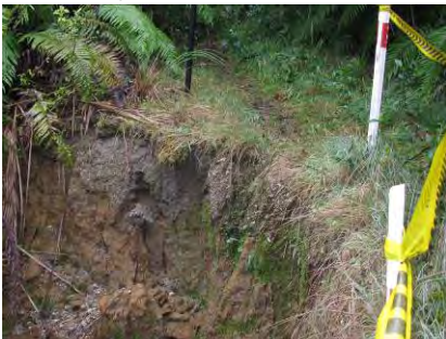
The junction with sign