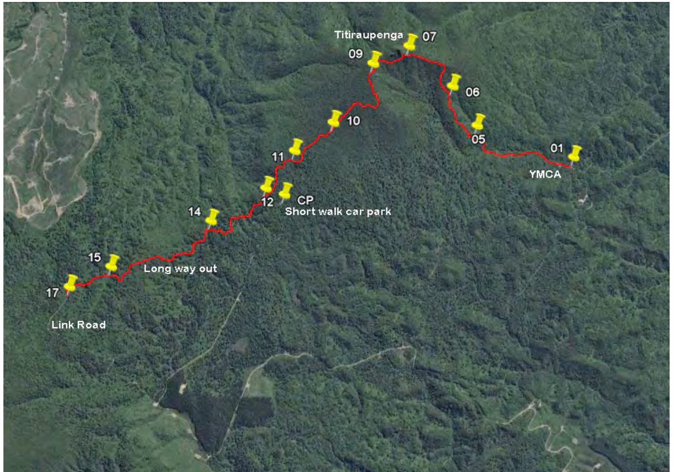
The track not to follow – Link Road