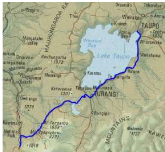
The route described on the left is shown above