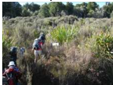
Thick bush with Old Baldy in distance