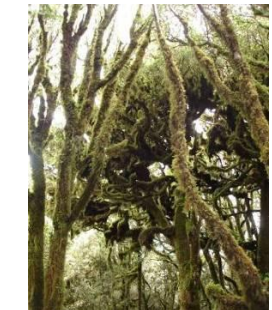
This has to be some of the wettest forest within the area