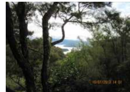
Glimpse of the lake