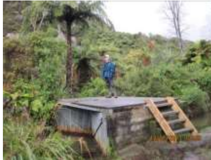
Fish trap box bridge