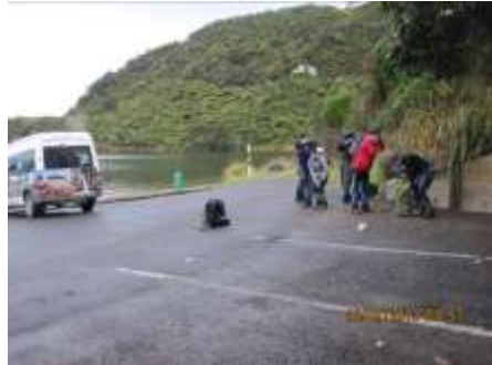
Car park at Punaromia Beach

Within ten minutes a T-junction ( TR03 306masl ) is reached where the route turns to the left or NE close in below the bluffs on a track following the contour in an area dominated by tree ferns. Right possibly goes to the new carpark mentioned later. The shore line is quite closely followed for about 2km when some slopes start to appear ( TR04 308masl ) after crossing a mini-stream line. A rather flat promontory mainly with Kanuka – Karikaria Point – is crossed ( TR05 309masl ) where a mapped stream was never seen.