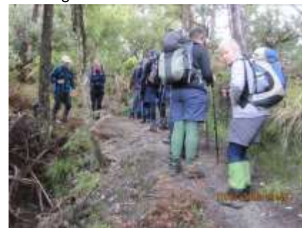
Narrow and eroded