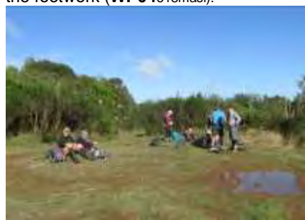
The clearing ( WP03 )

From here the direction stays the same but the track does degrade somewhat and can be narrower as it passes through rolling to hilly terrain where some of the slopes are bare, slippery red clays so watch the footwork ( WP04618masl ).