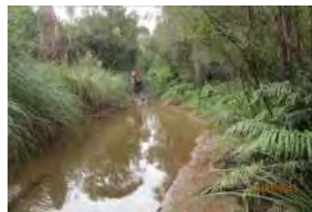
Red clays, water and Toitō

From : 13-May-15 08:49:41 To : 13-May-15 15:55:24 Moving time : 5:45 min Time taken : 7:05:43 Total Distance : 21.889 Km Flat map GPS Distance : 23.05km Minimum Speed : 0.016 KPH Maximum Speed : 8.008 KPH Average Speed : 3.085 KPH Minimum Altitude : 341 Meters Maximum Altitude : 725 Meters Total ascent : 642metres