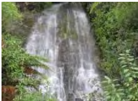
Waterfall ( WP11 )

The return route was back to Iron Hub Junction ( WP07 ) then follow the badly overgrown track heading northwards. Five hundred metres to the NNE arrives at a Y-junction ( WP09719masl ) where the right hand fork is followed, this is steeper than to date and a bit tricky at times but it is much drier underfoot. The heading remains to the ENE apart from a few squiggles until after a steepish slope down the road of the 42 Traverse ( WP10523masl ) is arrived at.