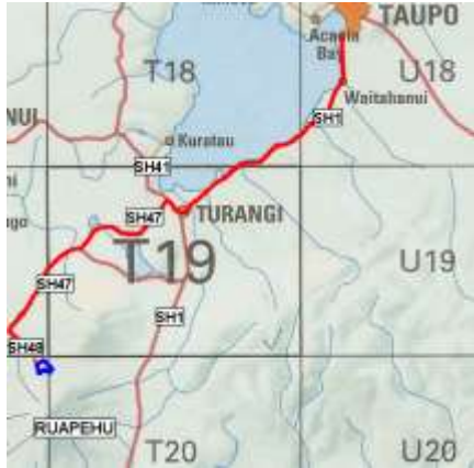
Access in RED and tramp route in BLUE