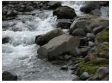
High up the gully