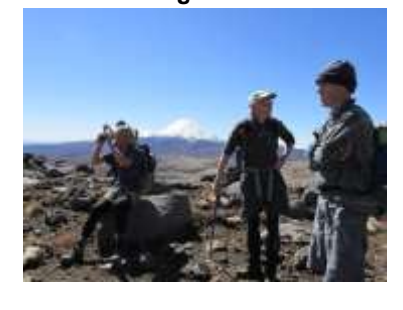
Above Happy Valley